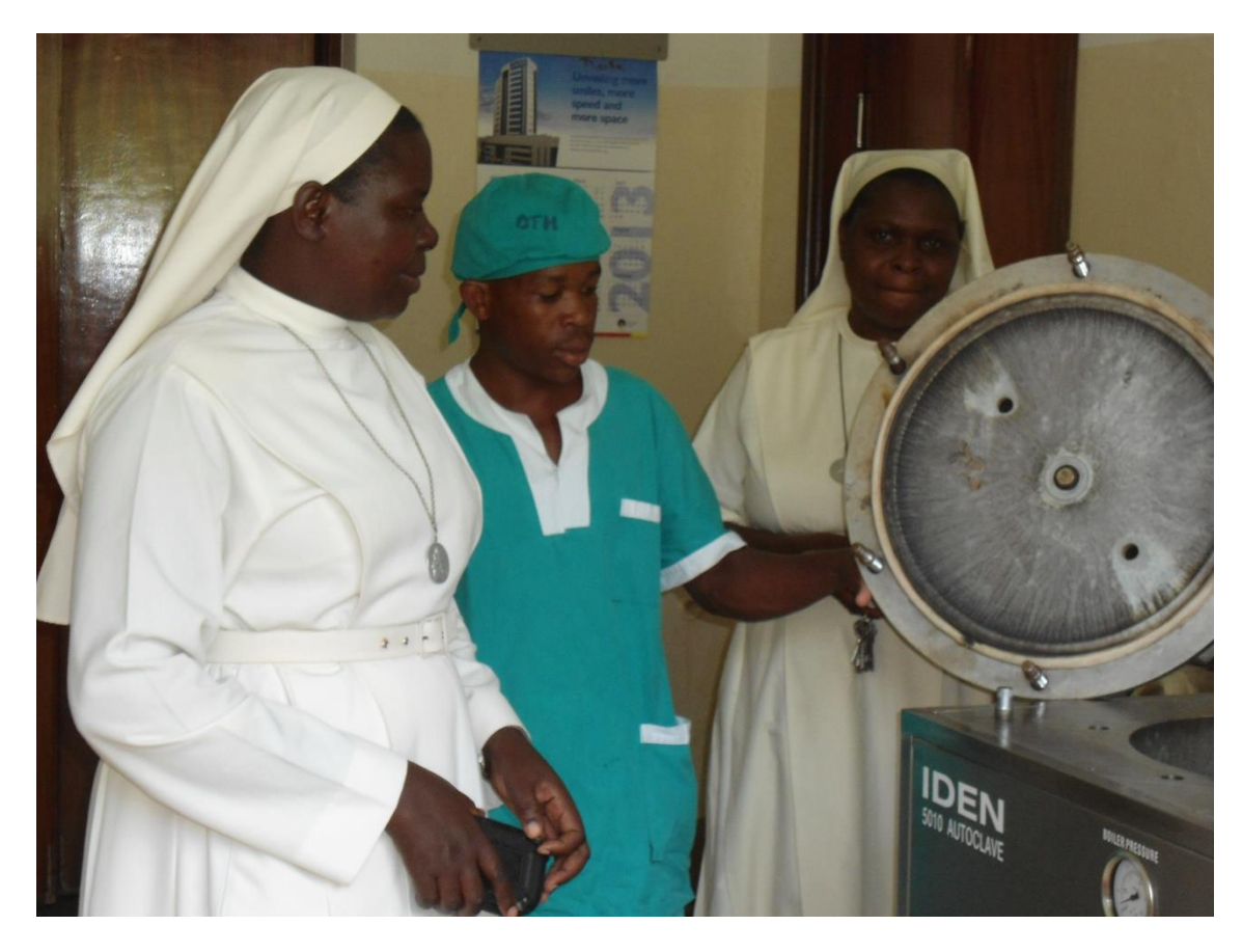
Figure 3: The Hospital Administrator, a theatre staff and the Hospital Accountant, inspecting the new Autoclave machine