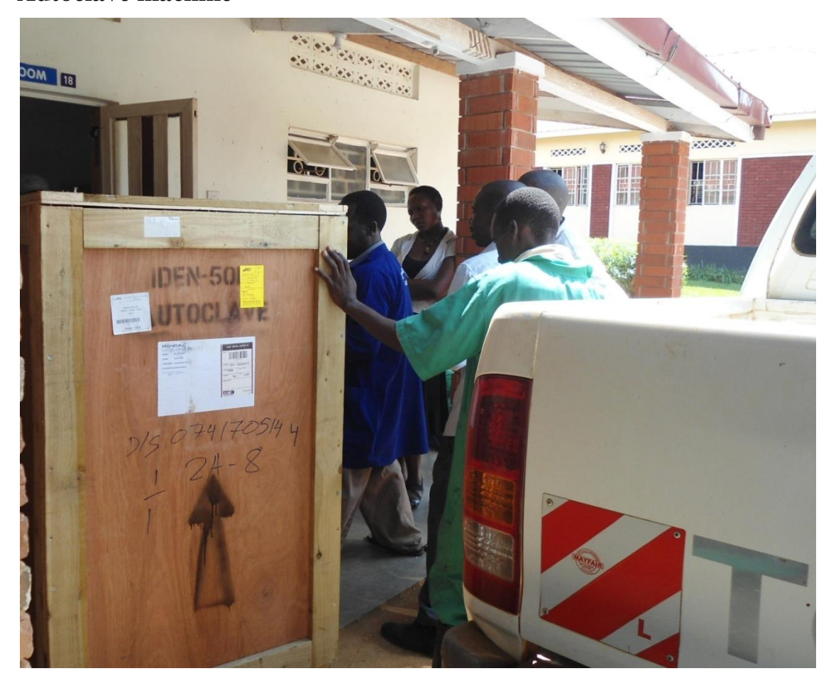
Figure 1: The Medical Director together with staff unloading the Autoclave Machine

Illustrations showing the receipt, installation and operation of the new Autoclave machine