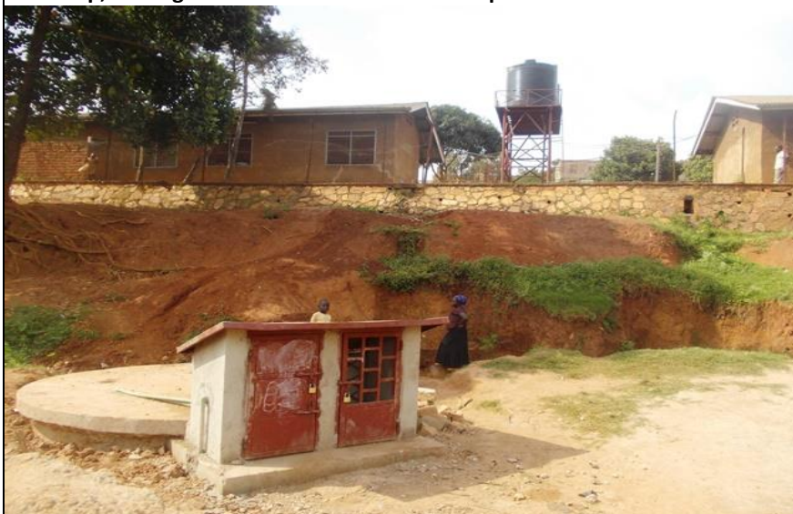
Overview of all works implemented.

Management of St. Michael Children's Home will operate the facilities on behalf of the community and has signed a Service Agreement for preventive maintenance 3 times a year.