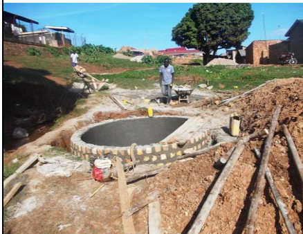
Making the underground tank