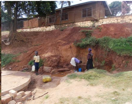
Underground tank near well