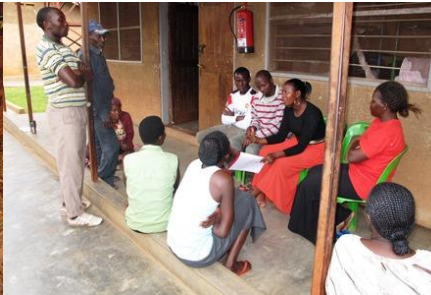
Explanation of the Manual.