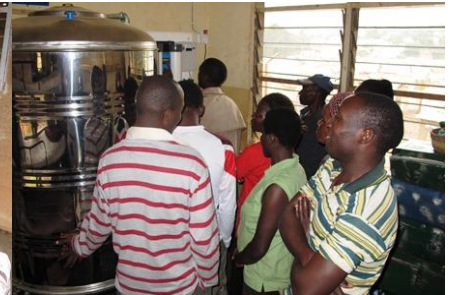
Instruction at the purifier

The purifier is just inside the building left from the tower with the tanks. The purified water is stored in a 1.000 liters stainless steel tank inside the same building (picture above).