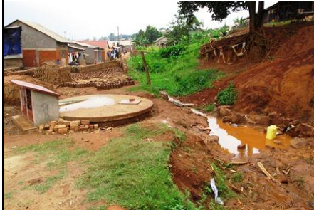
Pump, underground tank & well