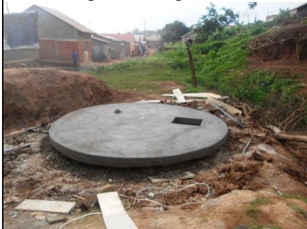
Underground tank finished