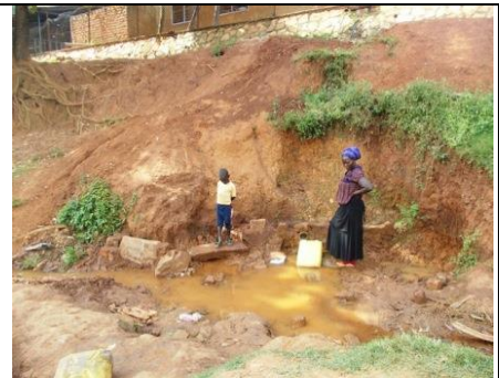
Down in the valley is a natural well

There is water down in the valley which can be purified into safe drinking water for all community members by constructing an underground tank.