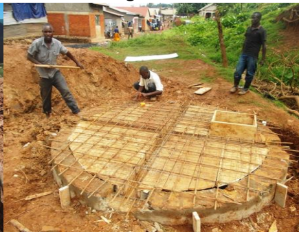
Covering the underground tank