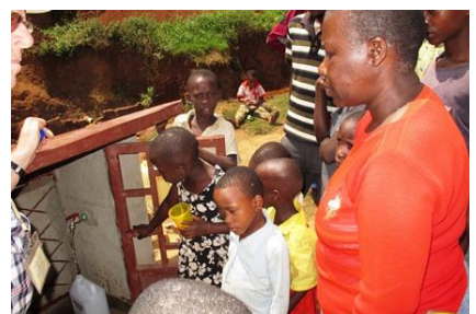
The Children highly interested and enjoying the water