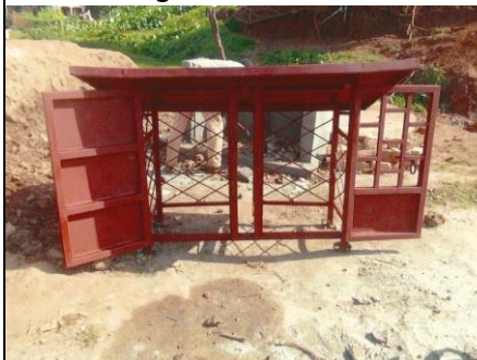
A steel cage to protect pump and taps