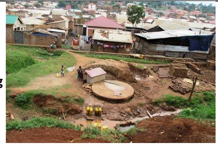
Aerial overview from top of tank tower

Drinking water distribution will be controlled.