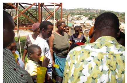
Attentive community members