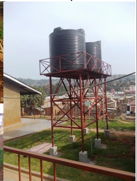
A tower with 2 tanks of each 4.000 liters has been constructed in the compound of St. Michael.