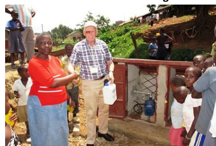
Chairperson receiving a 5L jerrycan with safe drinking water