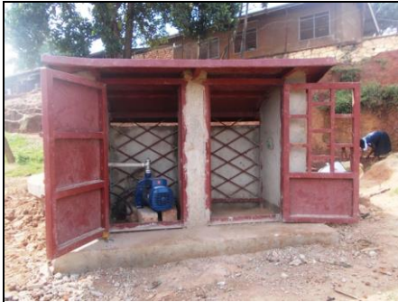
Installation of pump

The Pump House has 2 rooms. One is for the installation of the pump.