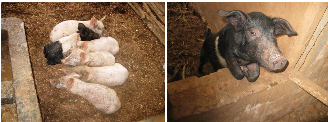
The surviving Pigs in the farm after Swine fever epidemic