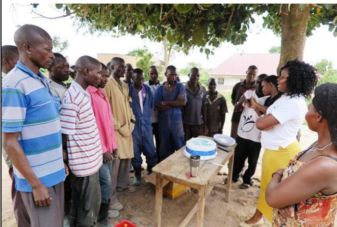
HAPPY NEW YEAR FOR THE ENTIRE CONSTRUCTION TEAM WITH ALL WORKERS