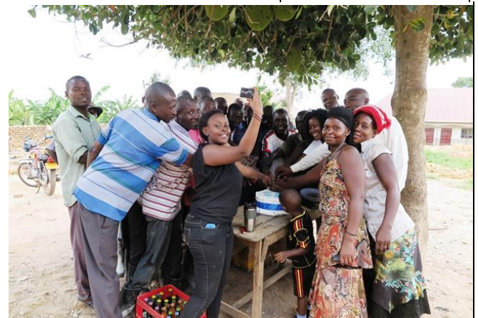
WITH TEAMWORK IT IS A PIECE OF CAKE TO CUT THE CAKE