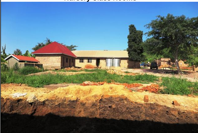
In the Christmas week the Girls Dormitory has been roofed