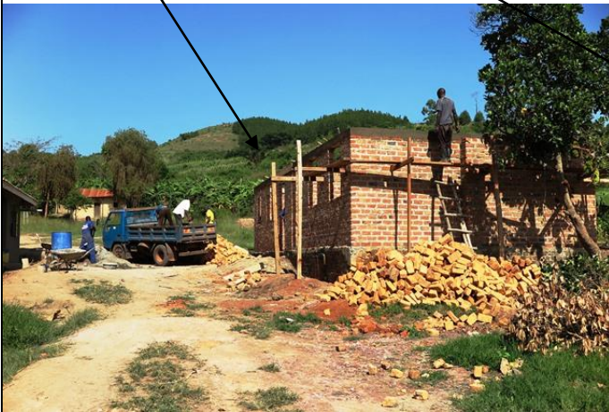
Nursery Class Rooms

The right arrow points to the Kitchen just started before Christmas. Today on the 30 th of December the workers have started raising the walls (lower picture right).