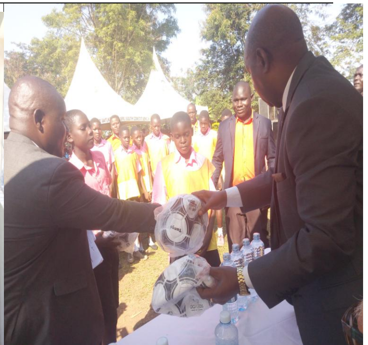
Handover of the balls

As the Minister of Sports, he could not leave without talking about Talent Developments of children at an early age, “parents and teachers should be very supportive to build the children’s talents” he said. He gifted the pupils with six balls which will help them develop their sports. He concluded his speech by giving Certificates to Tusaidiane and Mirembe Foundation. We there after went with the minister and parents to launch the laboratory by cutting the ribbon for opening.