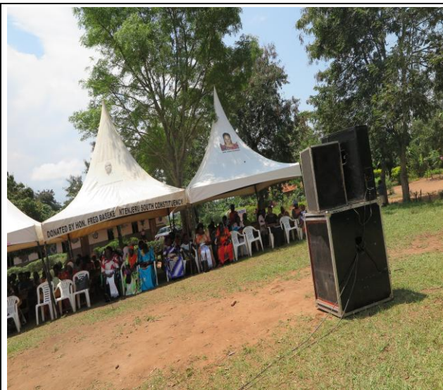
Parents waiting for the start of the function