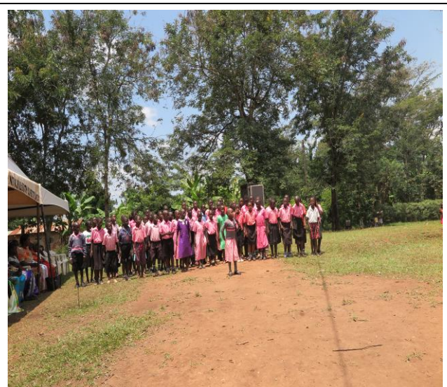
Students performing songs

On the 15 th of August, we attended the function to launch the grand opening and the chief Guest was Hon. Minister for Sports Charles Bakabulindi who arrived at 2.00pm. We went for lunch, and