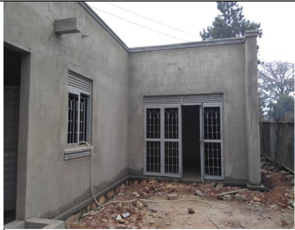
All exterior windows and door to the saloon is fitted