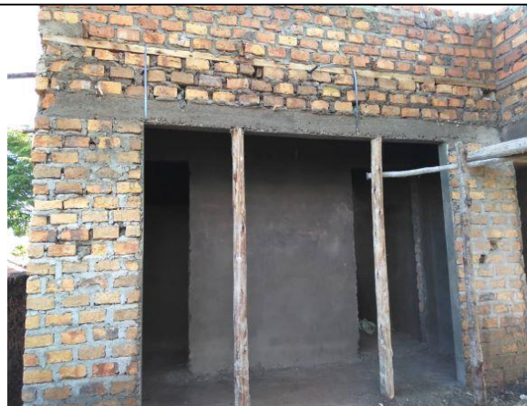
Interior plastering is done