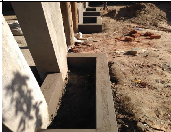
Flower pots for planting in flowers for beauty