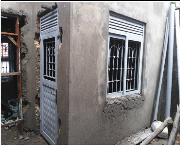
One of the Interior doors and windows fitted