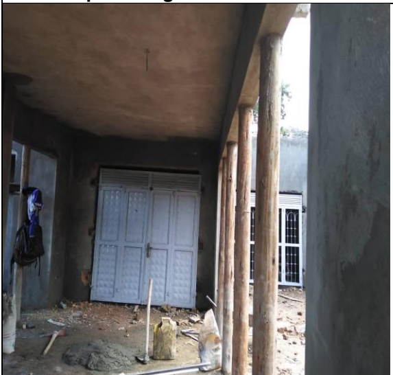
Main door to the reception area is fitted