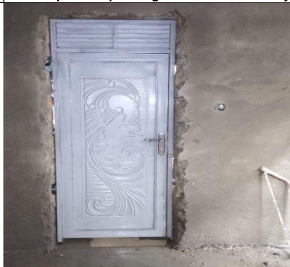
Back evacuation door is fitted