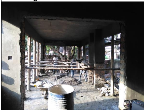
Plastering of the eating/dining area