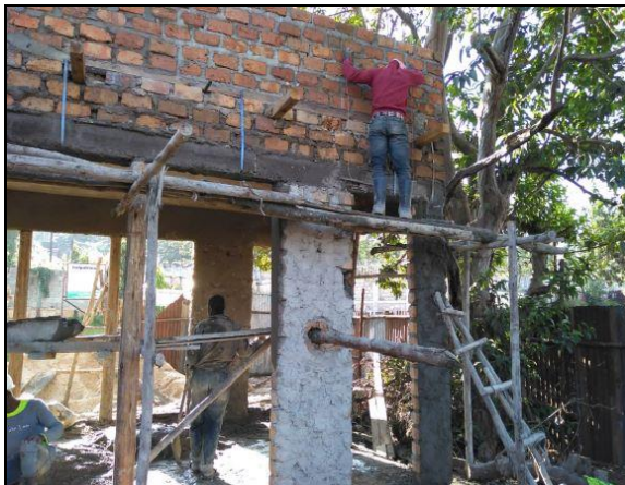
Plastering kicks off

Work resumed as soon as possible after Christmas. The interior and exterior plastering is done. All doors and windows are fitted. There are overruns for the construction but work is still going with the available funds and another report will be handed in when more work is done. Please find the progress pictorial report of the works. The board of Elizabeth Namaganda Foundation is beyond grateful to Stichting Mukwano and all the sponsors for funding this project. May God richly bless you!!!!