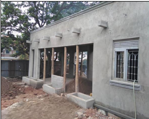
Exterior plastering is done