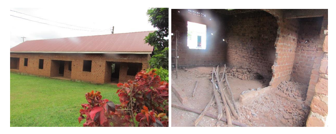
The unfinished building which has three unfinished chambers that can be turned into spacious classes.

1. We have to prepare our premises (unfinished building in the premises) according to the standard operating procedures as recommended by the ministry of Education. This implies acquiring spacious classes and fitting which allow one trainee one deck.