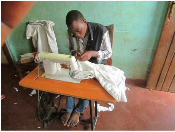
Vocational skills training continued during the lockdown namely Tailoring, Music, sweater making and crocheting.