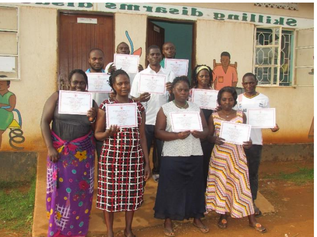
Some of the staff members of BISTC who were trained in first-aid drills posing with their certificate.

In year 2020 BISTIC registered 40 children who underwent skills training despite the interruption of Covid-19 pandemic.