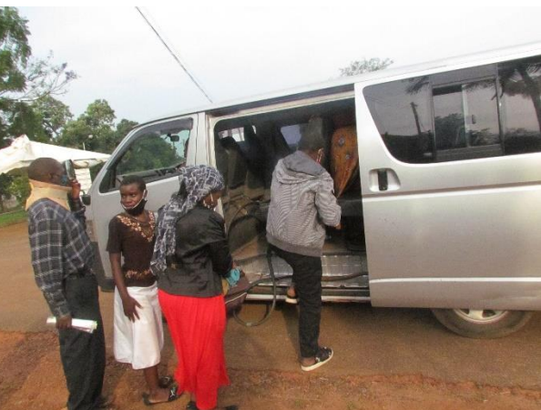
The first group of Bi-polar patients being taken from to Butabika hospital.