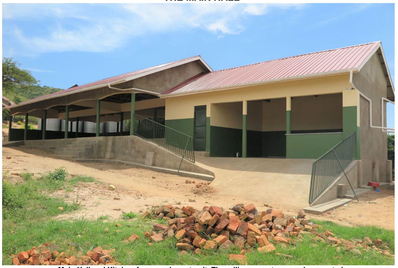
Main Hall and Kitchen form a coherent unit. The railings are strong and supported. Hall and Kitchen can be entered by wheelchair and through steps. Around the building there are well-finished veranda's. The Main Hall has different functions: dining hall, meeting hall and theatre stage.