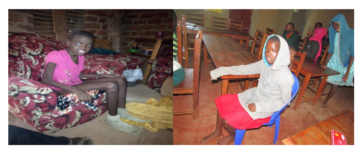
Kirabo just after being rescued from the pastor.