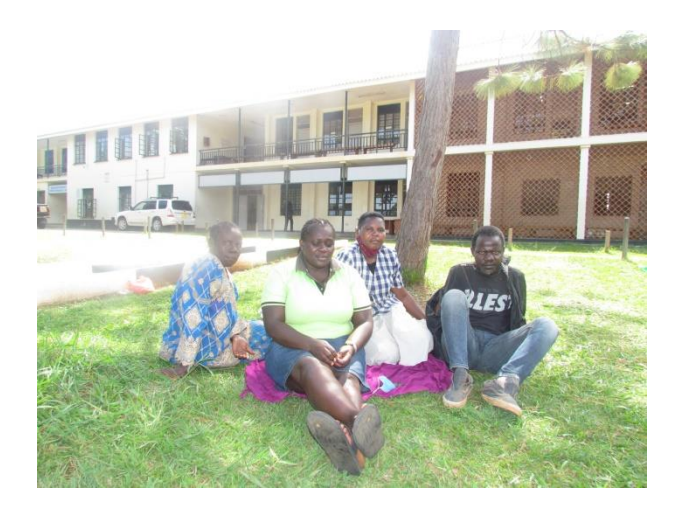
Mental rehabilitation programme

This programme started during the covid 19 pandemic and it involves sensitizing people from different communities about disabilities, types, causes, prevention and how to manage a person with a disability. This programme has showed a great impact on the minds of people about disabilities.