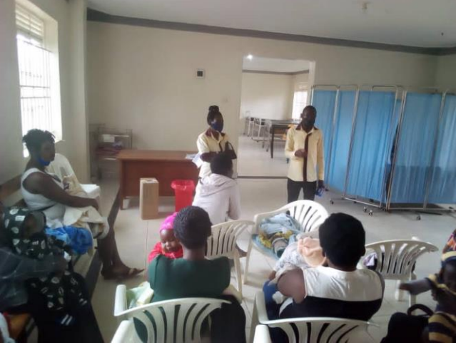
Presentations at Kitebi Health Center in the Immunization Department

This programme started during the covid 19 pandemic and it involves sensitizing people from different communities about disabilities, types, causes, prevention and how to manage a person with a disability. This programme has showed a great impact on the minds of people about disabilities.