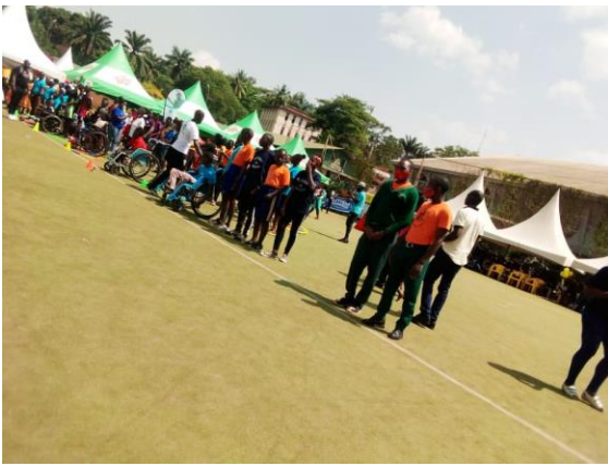
Some of the trainees at Lugogo during the Awareness day