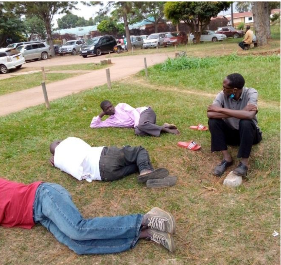
Some of our patients at Butabika Hospital waiting the medication