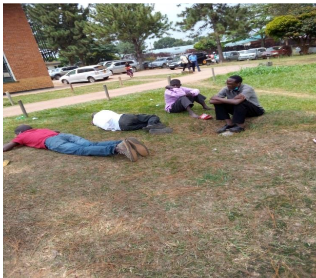
Our patients waiting for medication at Butabika Hospital

After carrying out research in the community, we realized that they were many mental cases in the community so BISTC came up with a suggestion of taking people with mental illness to receive drugs from Butabika hospital. We have registered 14 people in this programme and some of them are promising to receive vocational skills from BISTC while at the same time attending to hospital reviews every month. This programme is running smoothly since it started in 2021.