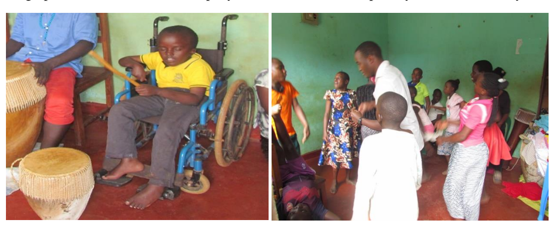
Fig. 1. Zziwa playing a drum

So I choreographed some dances to accompany the drummers and I hope they can learn this very well.