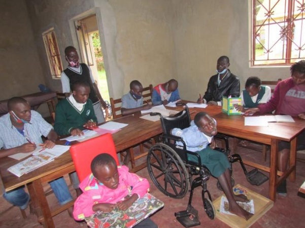
Children in literacy class being helped by the trainers.