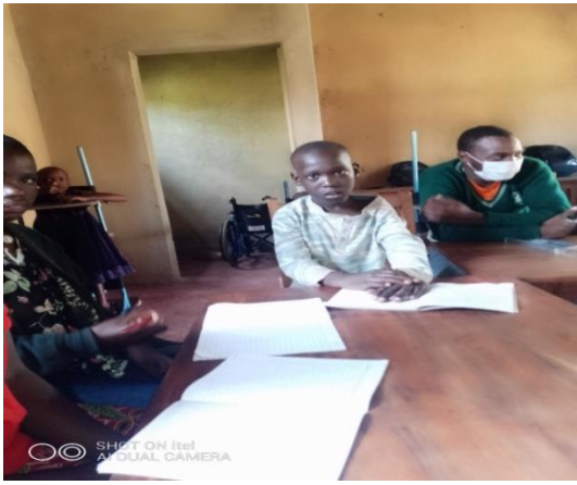
Some of our trainee in the literacy class trying to learn how to read and write