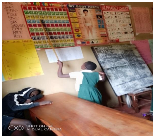
Belindah also leads the class