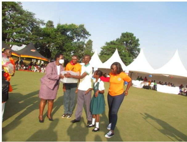
BISTC Trainees at Lugogo