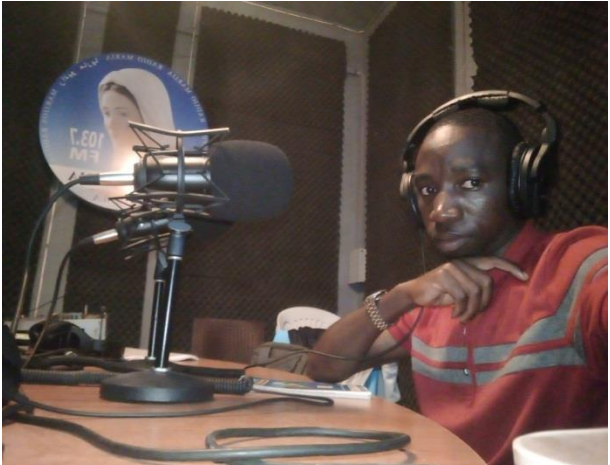
Fig. 1& 2 While in Radio Maria Uganda's studios for live programs about disabilities

Mental Rehabilitation Program: SEECHILD has tremendously continued to tirelessly carry on the mantle of organizing and transporting the patients with mental problems to Butabika Hospital for medication and reviews every month. The number of people that subscribe to this service has shot high and in a little while, we shall need to have a bigger vehicle or use two trips every month. This portrays that the programs has deeply been understood and hence masses have appreciated its relevance within our community and beyond.