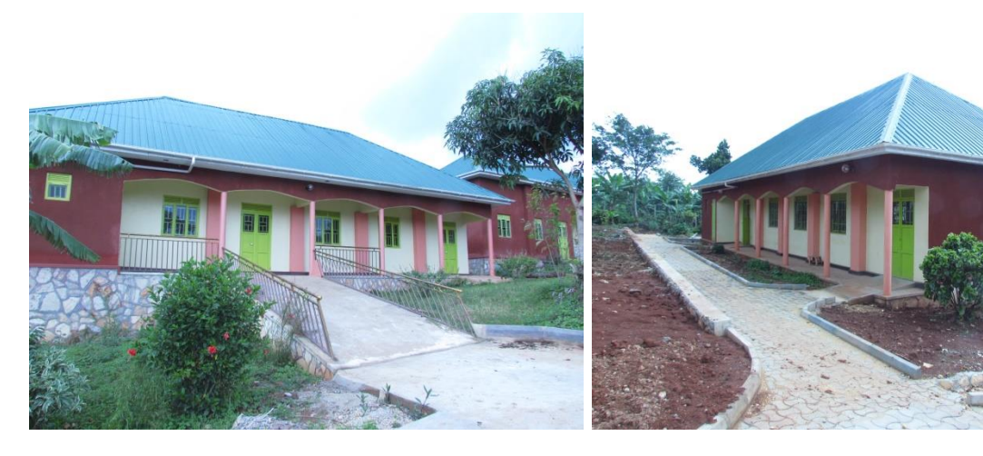
The two self-contained dormitories at MISTC