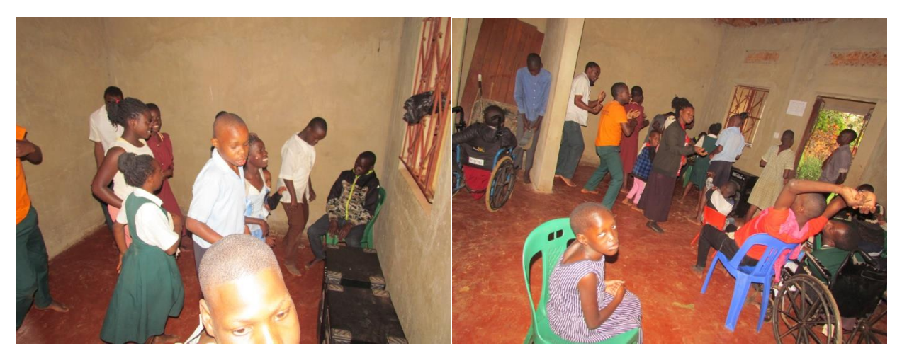
Dancing class at BISTC

The dance sector involves performance of the various kinds of dances, both western and traditional, hence the children are expected to learn how to dance. But just as it is for the music sector, only a handful of students are able to dance. The majority are hindered by their disabilities as explained below.