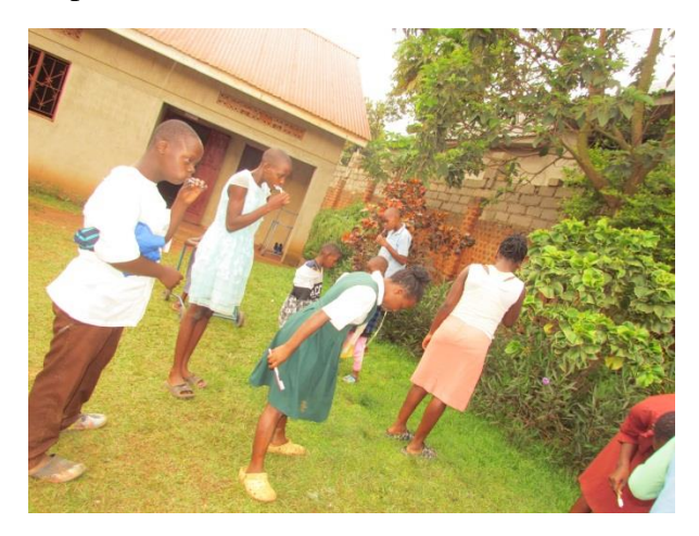
Trainees brushing teeth

Under this activity I do teach some trainees how to use sponge and soap while bathing. I also help them to brush their teeth.