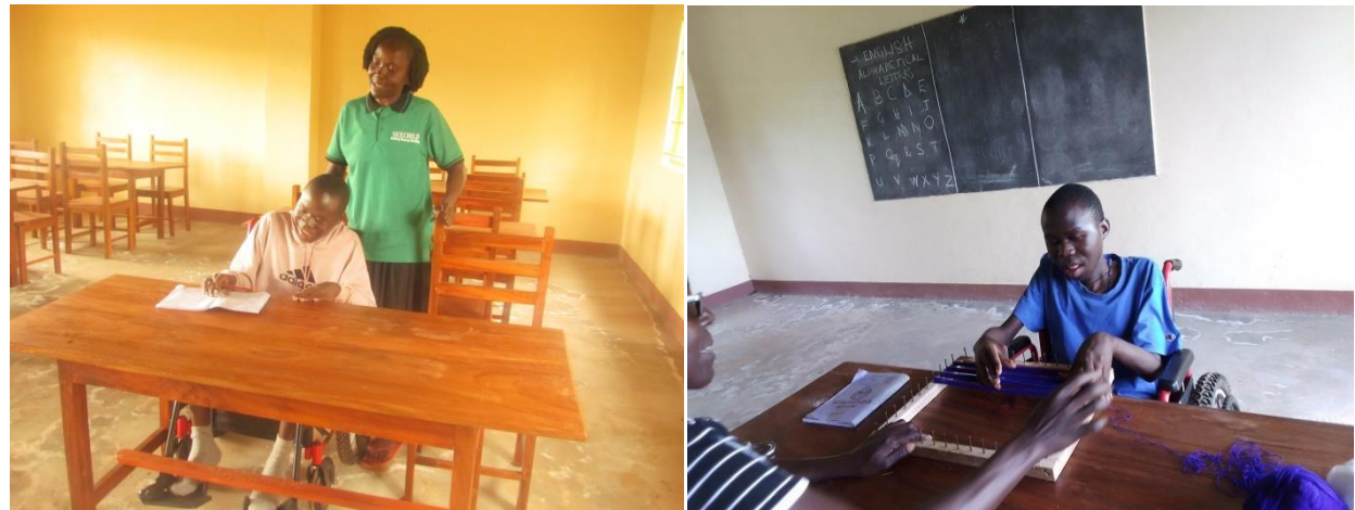
Mildred at work