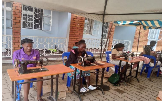
Figure 2 Some of the trainees in the second group during the lesson