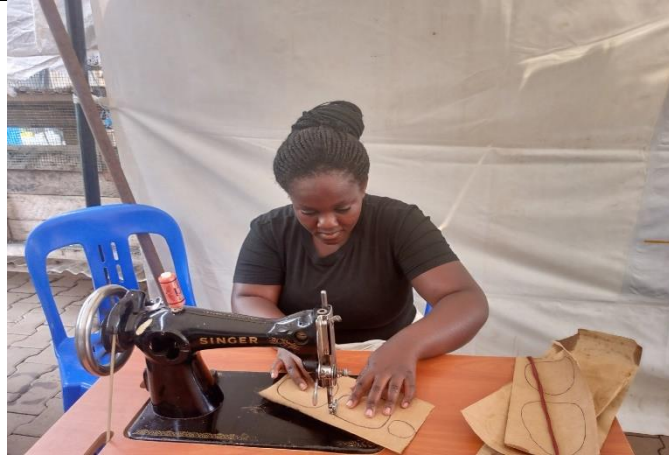
Figure 3 One of the trainees learning how to make shapes for designing