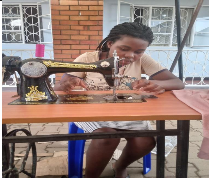
Figure 4 Our trainee trying to fix the machine in order to continue with the sewing