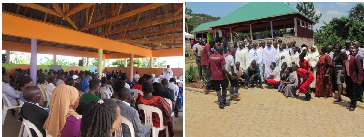
The launch of MISTC Centre