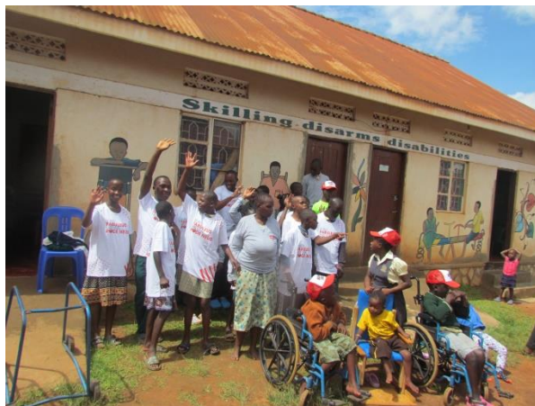
Some BISTC children happy in Tshirts and caps.