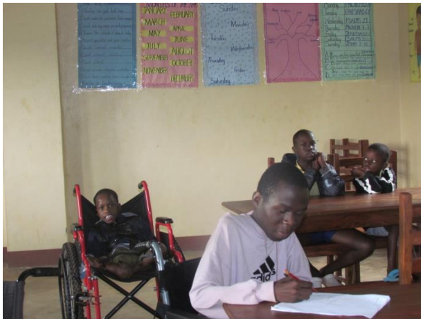
Trainees in literacy class.