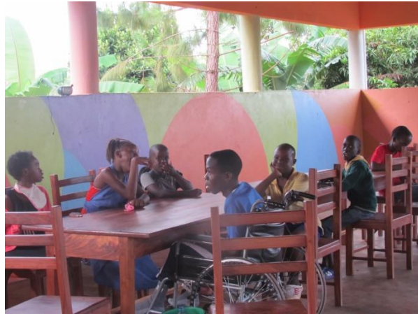
Children at Mpigi in Boarding section posing for a Photo and in the dinning hall.