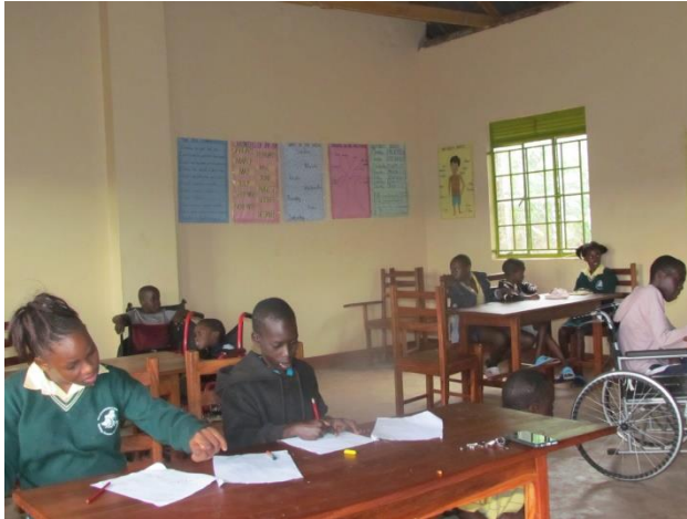
Literacy class going on.