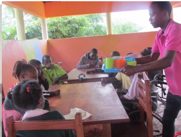
Trainees in the dinning being served Tea.