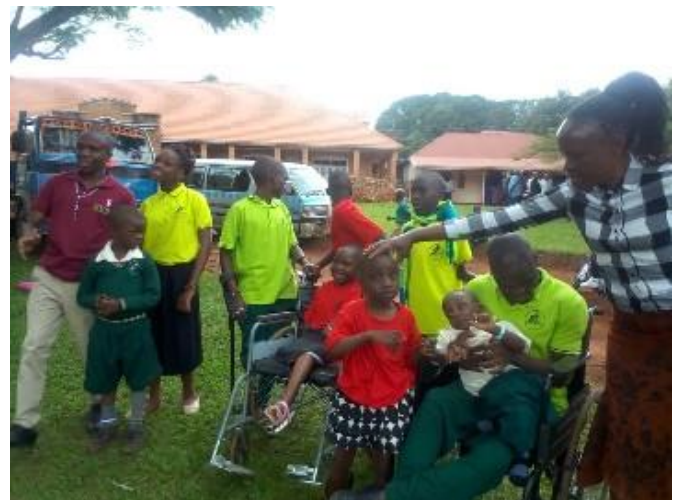
Photos of some of our children at Konge Catholic Parish