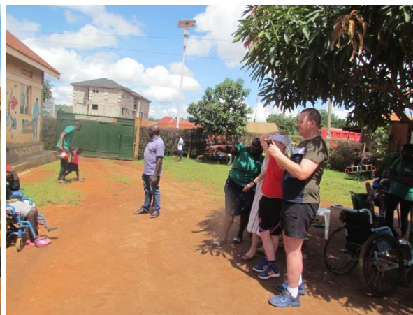
Wim taking the foto of children at BISTC.