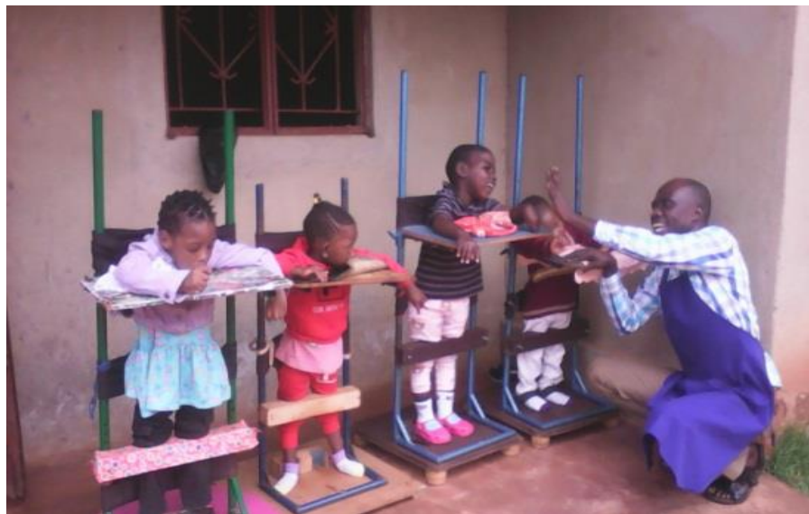
The head trainer helping children with cerebral palsy to stand in the standing frame after massaging them.