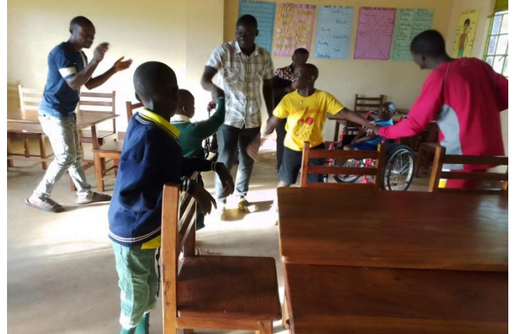
Children during class time

Our learners went to Konge Catholic Church to celebrate children's day.