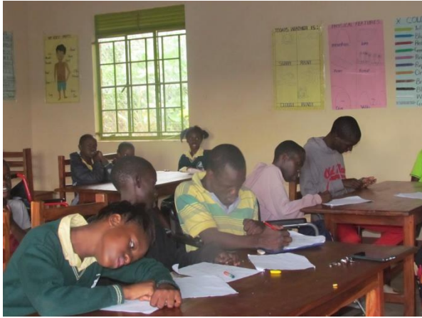
Trainees in art lessons