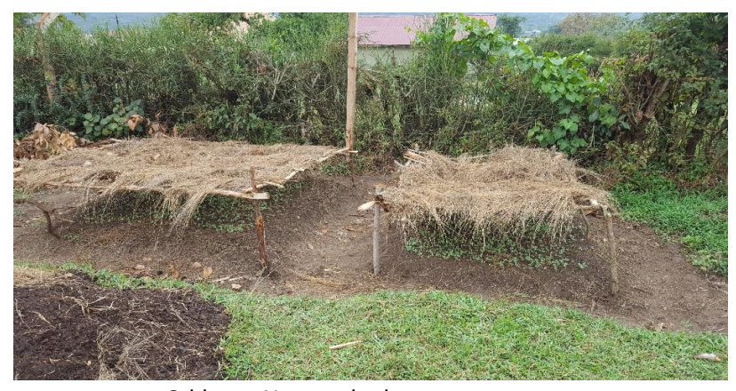
Cabbage Nursery bed