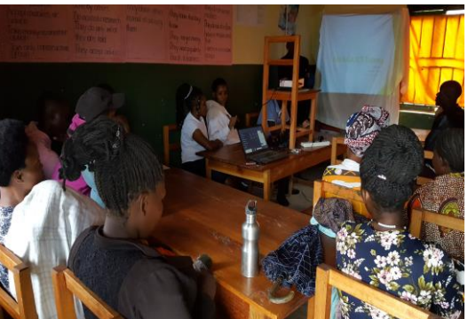
Training on ICT