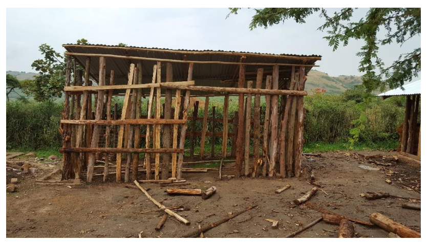
Cow shed constructed