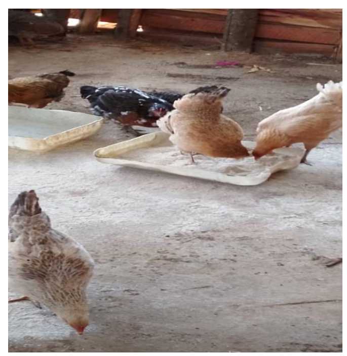
Chicken intheir house