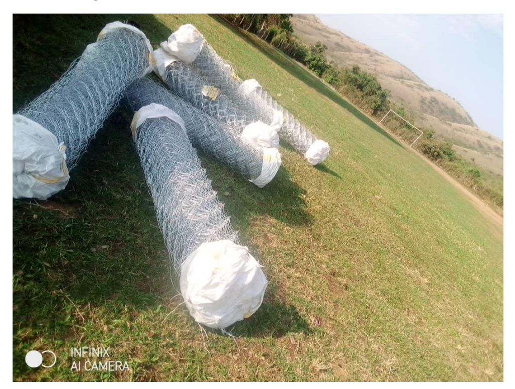
Chainlink rdls for fencing.