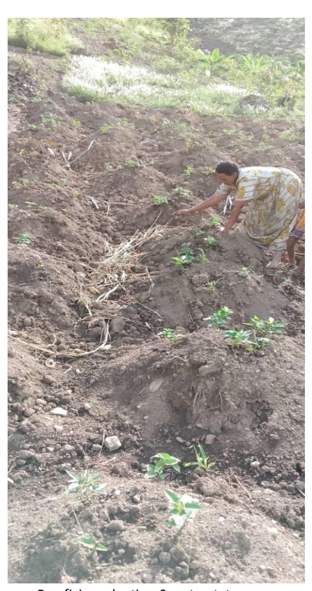
Beneficiary planting Sweet potato