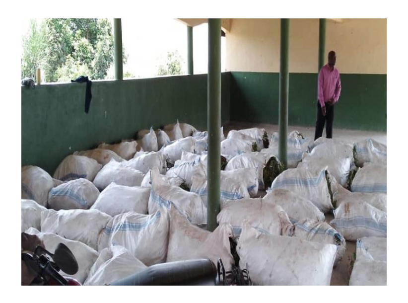
Sweet potato vines before distribution