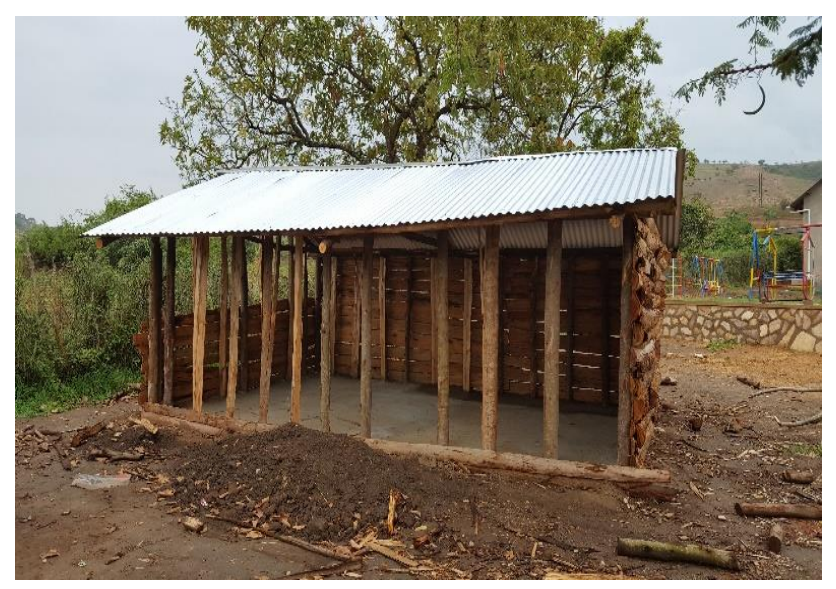
Chicken shed under construction