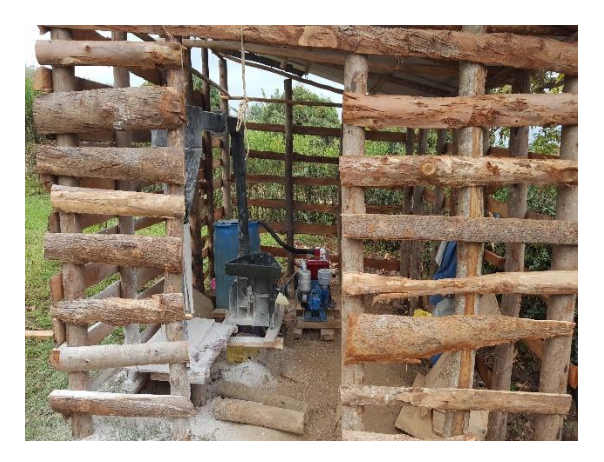
Maize milling machine