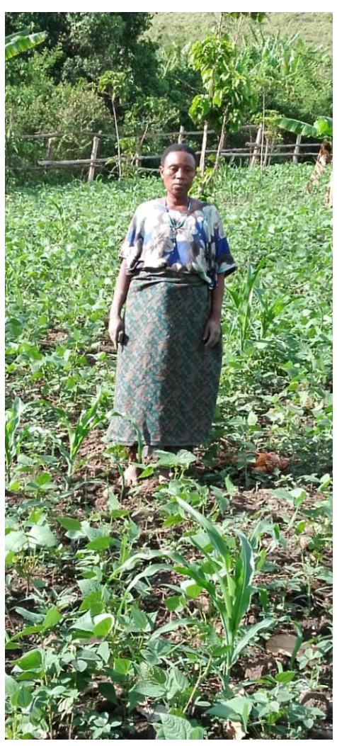
Benefi d ary i n her gar den